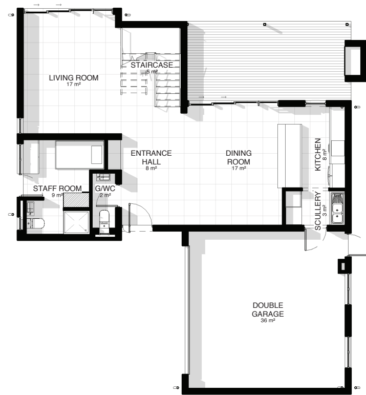
GROUND FLOOR LAYOUT