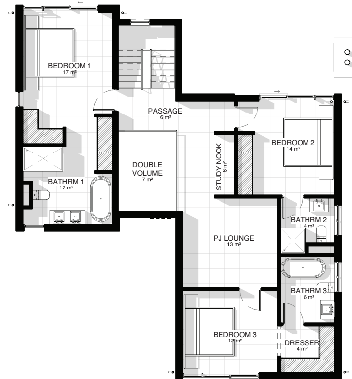
FIRST FLOOR LAYOUT